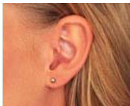
The finished earring

After care instructions will be provided after the procedure. The three key words to a problem free healing are CLEAN, DRY & AIRY and of course not to touch your newly pierced ears with your own hands.