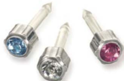
Silver Medical Plastic – 0% Nickel