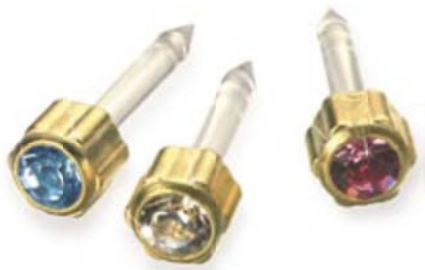
Golden Medical Plastic – 0% Nickel